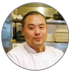
DAVID CHANG, CHEF AND RESTAURATEUR